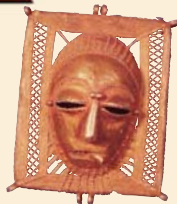
Place • Baule gold masks sometimes represent the face of an enemy killed in battle. ▲

Decide what you know about Africa south of the Sahara. In your notebook, record what you hope to learn from this chapter.