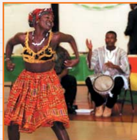
Culture • Traditional dances in Zambia are used for tribal ceremonies and entertainment. ▲