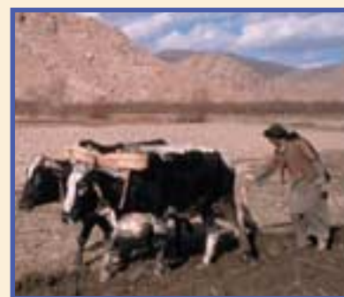
Place • Farmers in Afghanistan still use traditional methods. ▲

Decide what you know about India and its neighbors. In your notebook, record what you hope to learn from this chapter.