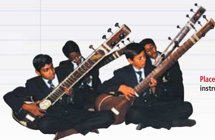
Place • The sitar is a popular instrument in India. ◀