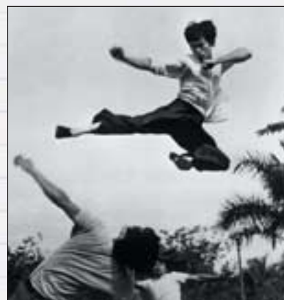
Culture • Chinese-American actor Bruce Lee brought kung fu to Hollywood. ▼