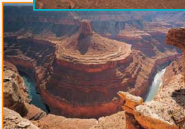
Place • Physical and human characteristics reveal patterns in places. ▲