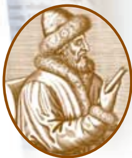
Ivan IV ▲

Place • Ivan IV has honored a Russian victory over the Tatars with the construction of St. Basil's Cathedral. ▲