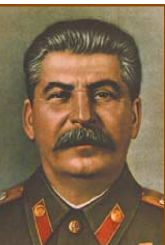
Region • Joseph Stalin ruled the Soviet Union from 1928 to 1953. ▲