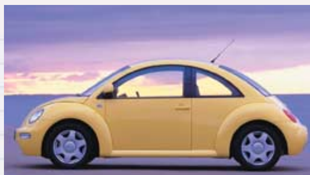
Movement • The German-made Volkswagen Beetle is the best-selling car ever. ▲