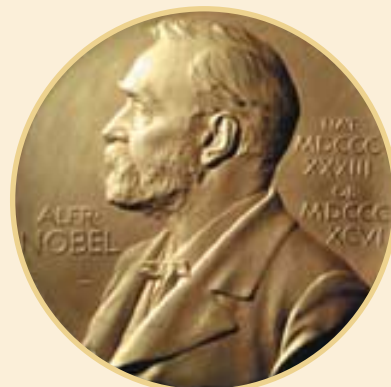
Region • Sweden's Nobel Prize honors great achievements worldwide. ▲

Consider what you know about the countries covered in Chapter 7. In your notebook, record what you hope to learn from this chapter.