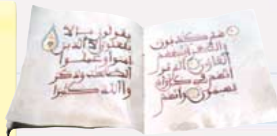
Culture • The Qur'an is the sacred book of Islam. ▲