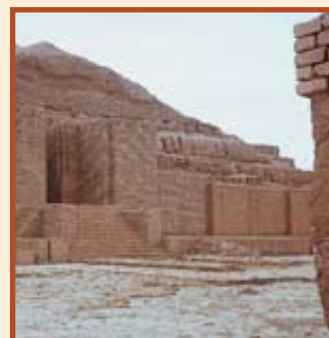
Place • Ziggurats were stepped towers on which temples were built in ancient Mesopotamia. ▲

Decide what you know about the physical features of the region and about ancient Mesopotamia, Egypt, and the Muslim Empires. In your notebook, record what you hope to learn from this chapter.